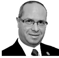
Marcos Vigil Deputy Mayor City of Jersey City