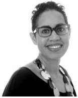
Vivian Brady-Phillips Deputy Mayor City of Jersey City